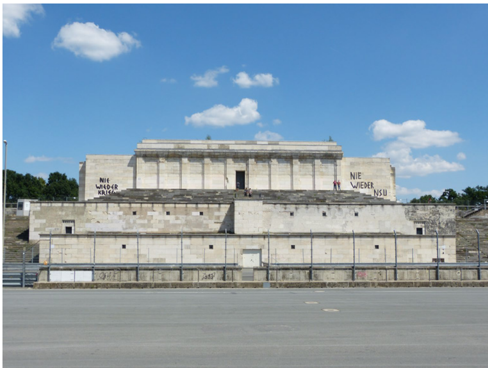
Figure 6. Zeppelin Grandstand with graffiti against war and NSU (so called “Nationalsozialist Underground”) in 2018.

In 2015, more than 230,000 people visited the Nazi Party Rally Grounds with guided tours (Macdonald 2006). At least as many people explore the site on their own, so that at least half a million people visit the party rally grounds each year out of historical interest (Bühl-Gramer 2019). Only about a quarter of these visitors are school classes, the rest are educational travellers and tourists in groups and individually. About half of the visitors come from abroad – at least that is the figure for the Documentation Centre Party Rally Grounds (Christmeier 2009). This high number of visitors to the area as well as the successful educational work done on the grounds would very much underline the area's value as a learning location. In future this educational function is to be further improved with better development of the area and an extended list of information points. The hall inside the Zeppelin Grandstand which was hardly ever open to the public is to be made accessible and explained with commentary. As a supplement to the Documentation Centre Former Nazi Party Rallies, the Zeppelin Field area which already has a large number of visitors today will then provide a great variety of information as well as learning locations and programmes. This is also necessary to provide the historic information to tourist visitors who sometimes come to the Zeppelin Field without any preparation.