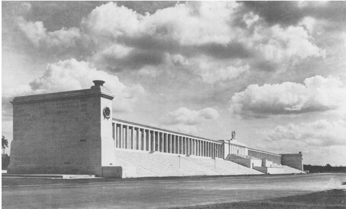
Figure 2. The Zeppelin Grandstand of Albert Speer 1938.