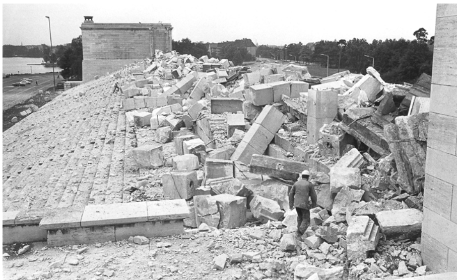
Figure 5. The blown-up pillars of the Zeppelin Grandstand in 1967.

'Hiding' or the attempt to hide not only concerned the history of the Nazi Party Rally Grounds, but Nuremberg's entire Nazi past. Thus, for decades, not only the foyer of the Zeppelin Grandstand was closed to the public, but the public was also barred from visiting Court Room 600 in the Nuremberg Palace of Justice where the Nuremberg Trial of the Main War Criminals had been held. Although again and again mainly foreign tourists wanted to visit the location of the trials, the Bavarian judiciary tried for a long time to evade this issue. Today, the building houses a permanent exhibition on the history of the Nuremberg Trials which is visited by 90,000 people from home and abroad every year.