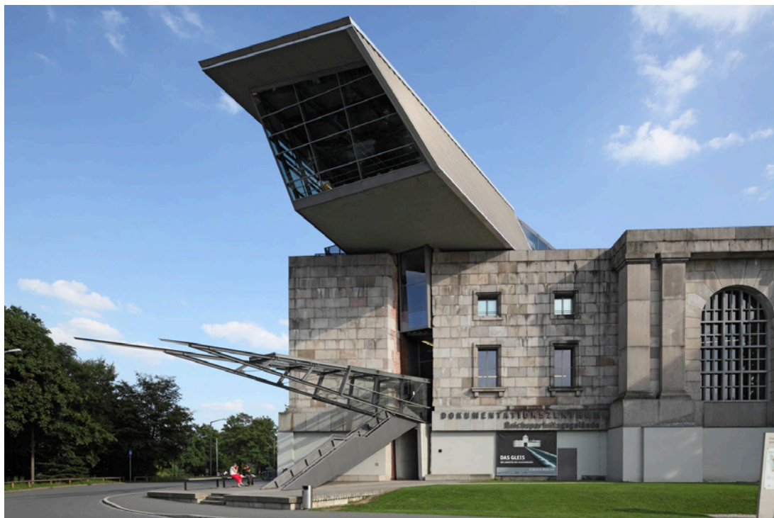
Figure 1. The architecture of the Documentations Centre Nazi Party Rally Grounds is a counterpart to the architecture of 1935.

Apart from the Luitpold Arena, the best-known part of the Party Rally Grounds is probably the Zeppelin Field which still exists today. It was designed by Albert Speer and almost completed by 1938; comprising the parade ground and surrounding stands. As one of the few implemented projects it hosted several events: the Wehrmacht’s demonstration manoeuvres, the roll-calls of the Reich Labour Service and the Political Leaders, as well as a so-called ‘Day of the Community’ were all held here. The area also became famous because of the ‘Light Dome’ formed by anti-aircraft searchlights and staged every year after 1936 during the evening event with the Political Leaders – an impressive staging of the idea of the so-called ‘people’s community’.