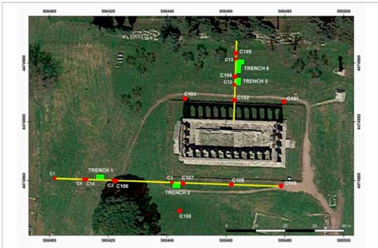
Fig. 1. Map showing the location of the north-south and east-west transect lines, trenches 1, 2, 5, and 6, the series of machine-made cores (101-110), and several of the cores made by hand on the transect lines. (M. Silani and M. Holobosky)

the exhibition on Poseidonia Città d'Acqua (Zuchtriegel, Carter and Oddo 2019), our chapter was called “ Nuova luce sul tempio di Atena: trasformare il paesaggio. ” It will be recalled that our research design involved three complimentary lines of fieldwork: (1) geophysical prospection based on ground penetrating radar (GPR), (2) coring done in two different ways (first by hand using a Dutch soil auger and then by machine-made cores taken down to much greater depths in the ground), and (3) the excavation of four trenches dug in different places at the site (Fig. 1). More will be said about each of them below. The aim of this short article is to focus on the research design of the project and the ways in which we brought the three lines of investigation together in an integrated approach.