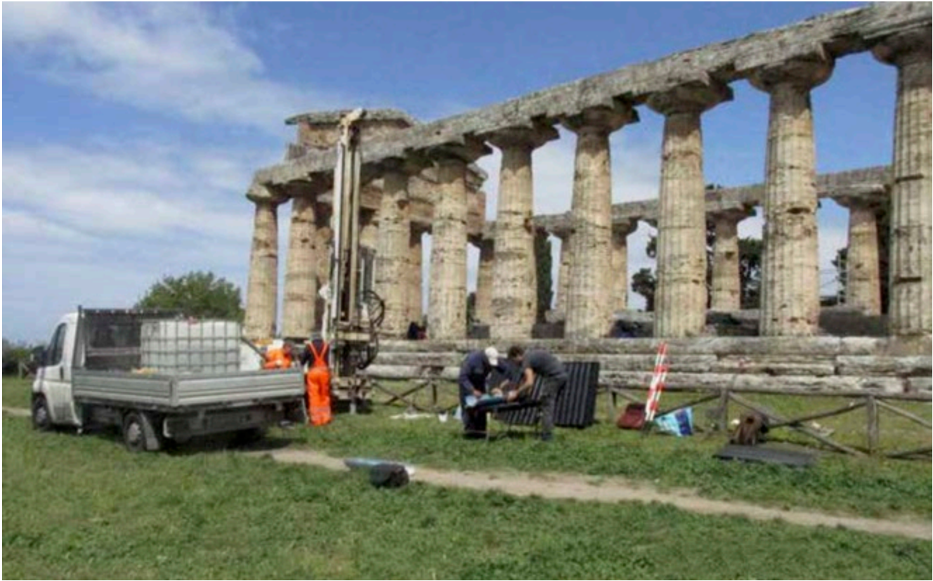
Fig. 6. View of core 109 being made on the south side of the temple of Athena.

an active interest in geo-archaeology, Damiano Paris and Pier Giorgio Sovernigo, also participated in the fieldwork.