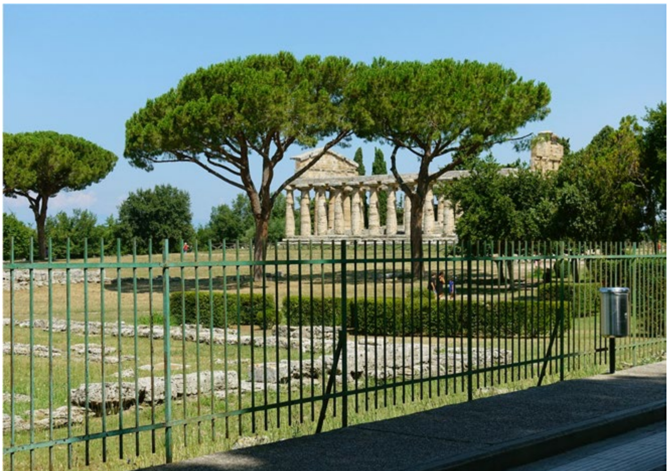
Fig. 3. View of the temple of Athens from the southeast (the Bar Museo) showing the shape of the artificial mound. Note the horizontal bar at the top of the fence and the large pine trees that obscure the view of the temple and mound from the south side.

In this context, it should not come as a surprise that the question of whether the temple rests on a natural hill or else an artificial mound drew so little attention in the last thirty years. It was, in some ways, simply a matter of visibility. It was only in August of 2017, when the GPR coverage was taking place (Fig. 4) and I happened to sit at a table outside the Bar Museo for a coffee break, that I could finally see in a clear way (guided by the horizontal bar at the top of the fence in Fig. 3) that the temple stands on an artificial mound and that the best working hypothesis for us to adopt was that it was created by design. Viewed in profile from a proper distance, it did not look like a natural feature on a travertine plain. Even though I had walked over the site a number of times, it was necessary to step back in order to recognize more clearly that what we were dealing with was a low artificial mound. While I had been thinking about the idea for some time, there was finally