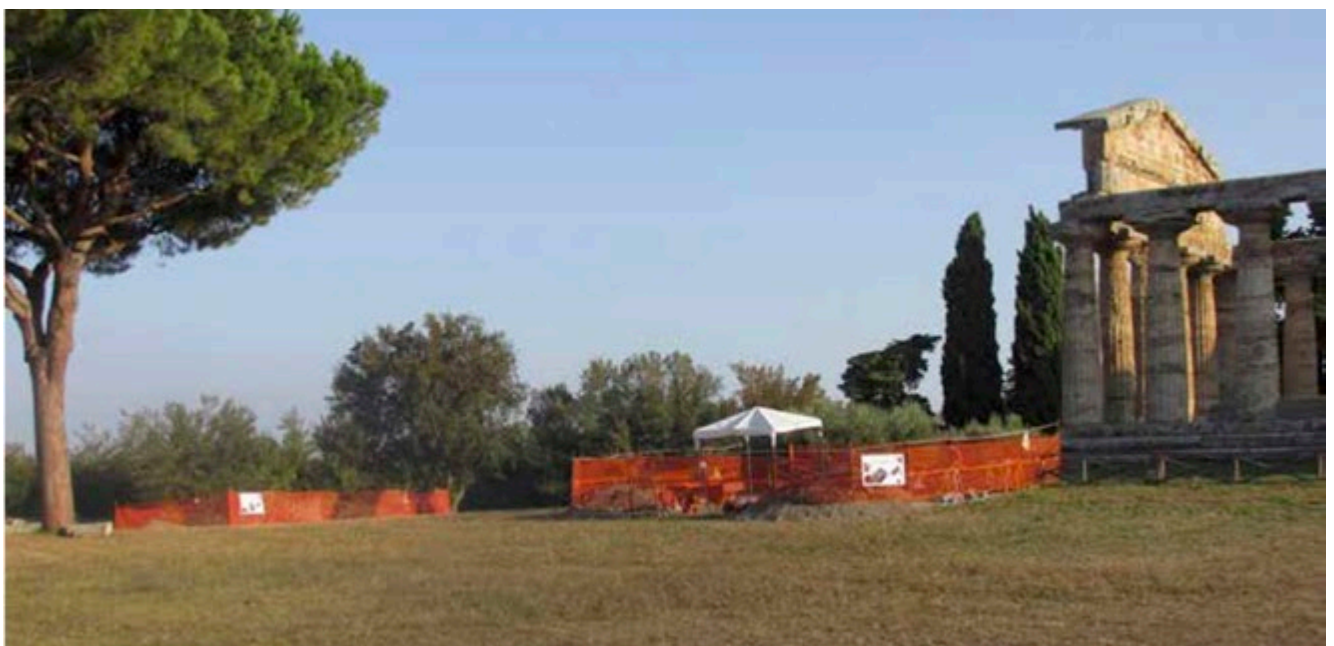
Fig. 2. View of trenches 1 and 2 on the west slope of the mound (see Fig. 1 for their locations on the east-west transect). Note the posters attached to the fences around both trenches

To put it another way, an archaeological park should be today more than just a quiet resting place for monuments. It should be a more animated place where the archaeologist is conducting fieldwork to gain a better understanding of the past. Toward this end, there would be a poster on display at each of our trenches (Fig. 2), which would include the name of the project (the North Urban Paestum Project or NUPP in our case), the institutions involved in the research, and its aims. In addition, the idea was for a member of our team each day to present on-site a short talk on such things as the aims of the research, what was currently coming to light at the site and the approach that we were taking to the work. When it was my turn, I would outline the three steps in our fieldwork – prospection, coring and excavation – and then point out the parallel with the same sequence in medicine today: first scanning, next endoscopy and finally surgery on a small scale (if called for). In terms of cultural heritage, archaeologists today would like to work in less invasive ways than their predecessors.