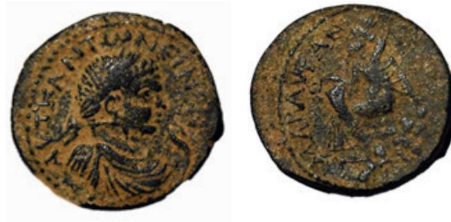
Figure 3. Elagabalus, Edessa, AE Medallion / Tetrassarion, c. AD 218-19. 4

OBV. Laureate bust wearing a cuirass and paludamentum facing right and seen from the front. In the right field before the bust is the animal-headed object facing right; AYT KANTWNEINON.