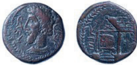
Figure 18. Wa'el, Edessa, AE tetrachalkon, c. AD 163-65. 54

While recognizing that the predominance of a traditionally Greco-Roman iconography in this series indicates a strong expression of imperial belonging, we should take caution not to interpret these symbols and images exclusively through a Greco-Roman lens distinct from local context. For example, the seated goddess, traditionally interpreted as the Tyche of Edessa and based on Eutychides of Sicyon's Tyche of Antioch, could be in some scenes Astarte, Atargatis, or another local goddess, or a synthesis of Tyche and another goddess. Thus Nike, Marsyas, a cornucopia, or serpent could take on different meanings with each goddess, as each of these goddesses had different roles and functions within the Edessene pantheon. 53 Moreover, they are occasionally paired with symbols recognizable within Syro-Mesopotamian traditions or hybrid images, local images whose identification is lost to us, or as a series of coins (as is the case with the tetrassarion with the Nergal symbol and the coins above). Among these the most common image and emblematic of Edessa itself is a Hellenic distyle temple (likely that of Marduk, Nebo, or both) within which is a cultic stone or cube set upon a table. The earliest example is found on a tetrachalkon of Wa'el, who usurped the Edessene throne from Ma'nu in AD 163 (see figure 18).