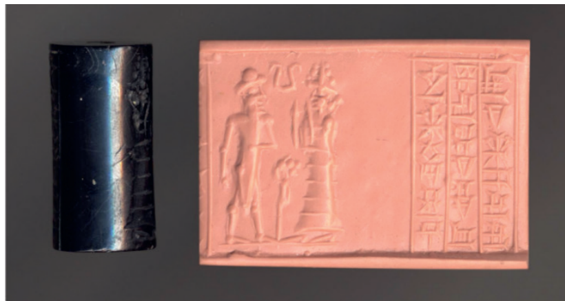
Figure 9. Cylinder seal and imprint, Late Old Babylonian or Kassite period, c. 1600-1400 BC. 12

Plaques from the same time period depict Nergal holding the scimitar (or sometimes a double-lion-head scimitar or mace) close to his chest. For example, a plaque from Kish near Tell al-Uhaymir (Iraq) and dating to the early second millennium BC (and now in the Ashmolean Museum) is representative of this depiction (see Figure 10).