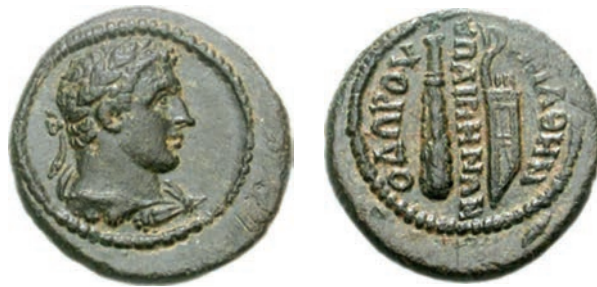
Figure 23. Pseudo-autonomous, Hypaepa, Phrygia, AE, Reign of Hadrian (AD 117-38). 61

Finally, a counter-argument that must be addressed is that the object in question is a stag- or deer-head version of Heracles' bow, such as that found, for example, on the coins of Hypaepa in Lydia, Sebaste in Phrygia, or Selge in Pisidia. (see figures 23-26).