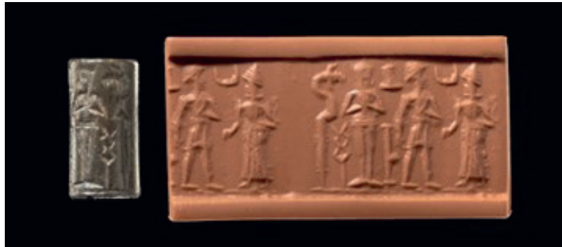
Figure 8. Cylinder seal and imprint, Old Babylonian period, c. 1850-1595 BC. 11

While the placement of the scimitar on various material objects changed over time (not completely, though), its appearance remained the same. For example, on cylinder seals from the Old Babylonian period (1800-1595 BC) it is in the ground next to Nergal or in his hand. These depictions show it as an enlarged scimitar with an 'S' shaped lion-head hilt, such as VA 08462 in the Staatliche Museen zu Berlin and BM 132841 in the British Museum (see Figures 8-9).