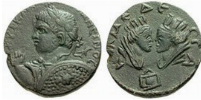
Figure 19. Elagabalus, Edessa, AE diassarion, c. AD 218-220. 56

The temple is commonly found on issues for Severus Alexander, Julia Mamaea, Gordian III, Tranquillina, and Trajan Decius. It is frequently held by the seated goddess and also accompanied by an uncertain god standing above the goddess or on a pedestal before the temple and goddess (for example, see figure 20). 57