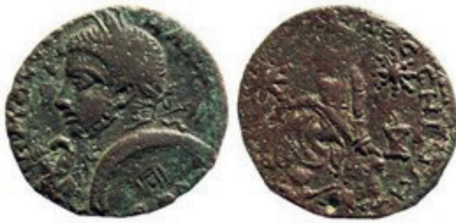
Figure 21. Severus Alexander, Edessa, AE diassarion, c. AD 222-35. 59

The polysemic nature of Edessa's 'hybrid', borderland/middle-ground culture is further seen on a tetrassarion of Elagabalus in figure 22. The coin itself belongs to the same large issue as that of our medallic tetrassarion. Here we see a traditional Roman military representation of the emperor on the obverse and the traditional 'Tyche' on the reverse with a cornucopia behind her. The shield that Elagabalus holds typically has a gorgoneion on it, but the engraver has modified that image into a cubic object within which is a circle and dot, and around it there are dangling serpents (the gorgon's hair unmodified). It is uncertain if the engraver intended to equate the cubic object with the apotropaic gorgoneion, although this is likely. It is possible that it is the cubic object from the temple with a round baetyl within it. Regardless, there is no comparable symbol or image found in traditional Greco-Roman iconography. The local meaning for this symbol is lost to us, however.