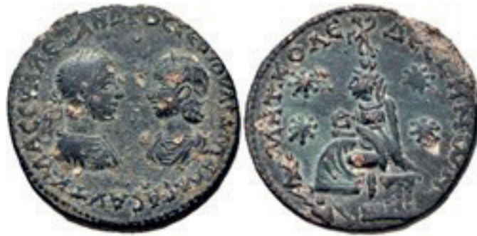
Figure 20. Severus Alexander and Julia Mamaea, Edessa, AE tetrassarion, c. AD 222-35. 58

The temple is commonly found on issues for Severus Alexander, Julia Mamaea, Gordian III, Tranquillina, and Trajan Decius. It is frequently held by the seated goddess and also accompanied by an uncertain god standing above the goddess or on a pedestal before the temple and goddess (for example, see figure 20). 57