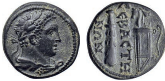
Figure 24. Pseudo-autonomous, Sebaste, Phrygia, AE, c. AD 100-150. 62