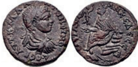
Figure 15. Elagabalus, Edessa, AE tetrassarion, c. AD 218-220. 50

and one where Nike decorates the shield of Elagabalus, who also holds a scepter and has his right hand raised ( adlocutio ). 48 There are at least five different issues with a cornucopia, and three with Marsyas, all of which belong to the earliest group of coins minted at Edessa. 49