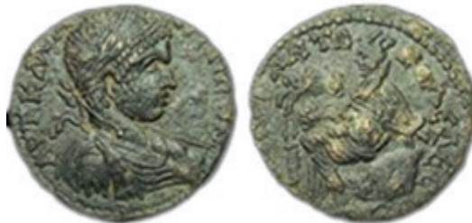
Figure 16. Elagabalus, Edessa, AE tetrassarion, c. AD 218-220. 51