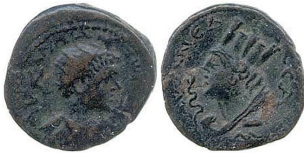
Figure 11. Elagabalus, Edessa, AE assarion, c. AD 218-221. 17