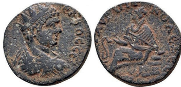
Figure 12. Elagabalus, Edessa, AE tetrassarion, c. AD 218-221. 18

Thus far I have provided a brief cultural history of the symbol and its association with Nergal and established its free-floating placement in the field as a late Neo-Babylonian period development. So, what are we to make of the presence of this traditional symbol on this coin, and how do we interpret it? Answering this question depends on understanding Nergal's powers and responsibilities.