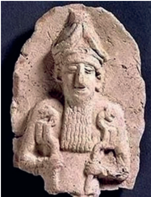
Figure 10. Terracotta plaque of Nergal From Kish near Tell al-Uhaymir in modern Iraq, early Second Millennium BC.

Various other objects likewise display the lion-head scimitar, such as on the shields of model chariots found at several sites such as Mashkan-shapir (Tell Abu Duwari) in central Mesopotamia and Ur in the south. 13 During the first millennium BC Nergal's symbol is found commonly on Neo-Babylonian boundary stones ( kudurru ) and magical tablets. 14 From lower to upper Mesopotamia, the objects reveal that Nergal's cultic symbols remained the same, although frequently placed with symbols of other gods depending on local conditions.