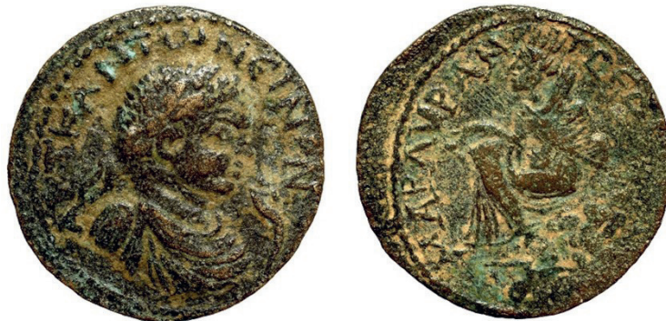
Figure 2. Elagabalus, Edessa, AE Medallion/Tetrassarion c. AD 218-19. 3