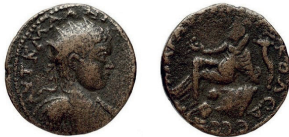
Figure 17. Elagabalus, Edessa, AE tetrassarion, c. AD 218-220. 52