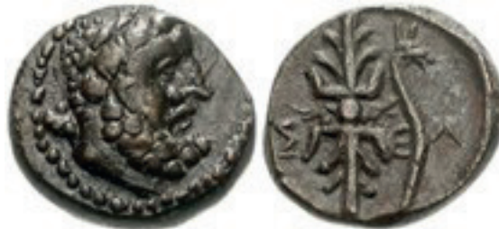
Figure 25. Selge, Pisidia, AE, c. 200-100 BC. 63