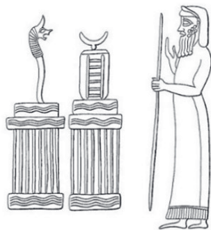
Figure 6. Drawing of cylinder seal imprint from Neo-Babylonian period, c. 612-539 BC. 9 Image from Black and Green.

While it is depicted in the field on some cylinder seals, it is more commonly represented as set on an altar during this time period, and usually accompanying a symbol of another deity likewise set on an altar (see Figures 6-7).