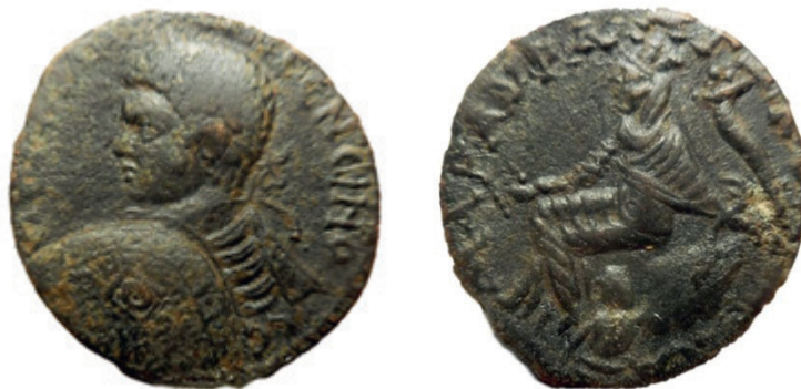
Figure 22. Elagabalus, Edessa, AE tetrassarion, c. AD 218-220. 60

The polysemic nature of Edessa's 'hybrid', borderland/middle-ground culture is further seen on a tetrassarion of Elagabalus in figure 22. The coin itself belongs to the same large issue as that of our medallic tetrassarion. Here we see a traditional Roman military representation of the emperor on the obverse and the traditional 'Tyche' on the reverse with a cornucopia behind her. The shield that Elagabalus holds typically has a gorgoneion on it, but the engraver has modified that image into a cubic object within which is a circle and dot, and around it there are dangling serpents (the gorgon's hair unmodified). It is uncertain if the engraver intended to equate the cubic object with the apotropaic gorgoneion, although this is likely. It is possible that it is the cubic object from the temple with a round baetyl within it. Regardless, there is no comparable symbol or image found in traditional Greco-Roman iconography. The local meaning for this symbol is lost to us, however.