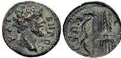
Figure 26. Marcus Aurelius as Caesar, Selge, Pisidia, AE assarion, c. AD 138-146. 64

If we accept this identification, it would appear that Edessa sought to depict either the new emperor as Neos Heraklēs or to symbolize the Greek hero as a companion, protector, and patron of Elagabalus. 65 There are few factors, however, that undermine this interpretation. Firstly, there is