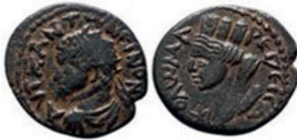
Figure 13. Elagabalus, Edessa, AE assarion, c. AD 218-20. 45

In general, the reverse iconography on these coins for Elagabalus is commonplace. Small issues maintain a bust of Tyche found on issues under Caracalla and Macrinus, while medium and large issues have the typical depiction of the Tyche of Antioch: Tyche wearing a mural crown, chiton, and himation seated on rocks facing left, leaning back on her left hand and holding fruit, a flower, a branch, or incense in her extended right hand. Below the rocks is a river-god swimming right, his head turned upwards (see figures 13-14).