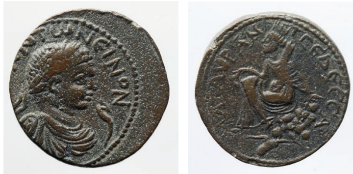
Figure 1. Elagabalus, Edessa, AE Medallion / Tetrassarion c. AD 218-19. 2

Following Elagabalus’ victory over Macrinus in June 218, the city of Edessa in Osrhoene issued a number of coins that celebrated and commemorated the ascension of the new emperor. On these early issues are symbols commonly found in the Greco-Roman iconographic lexicon (e.g., Nike, palm branch, and cornucopia). Among these coins, however, is a small medallion or a medallic tetrassarion with an enigmatic symbol (an animal-headed object) before the emperor’s bust, one of two issues from any of the Mesopotamian mints to have a symbol in the field on the obverse (the other is a small bronze coin for Caracalla with a wreath before the bust. For Elagabalus, see Figures 1-3). 1 The coin is unpublished. There are three specimens known to the author, all struck with the same obverse and reverse dies: