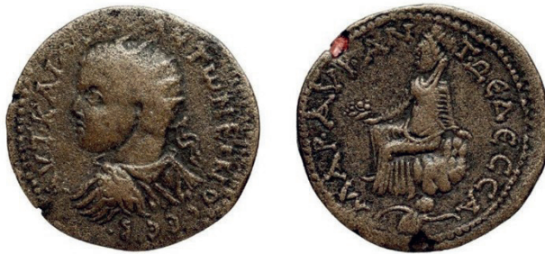
Figure 14. Elagabalus, Edessa, AE tetrassarion, c. AD 218-20. 46

On the coins above, the use of the accusative case AYTKANTWNEINON on the small issue, and the civic ethnonym and the artistic style of the large issues support the placement of the medallic tetrassarion in this series. 47